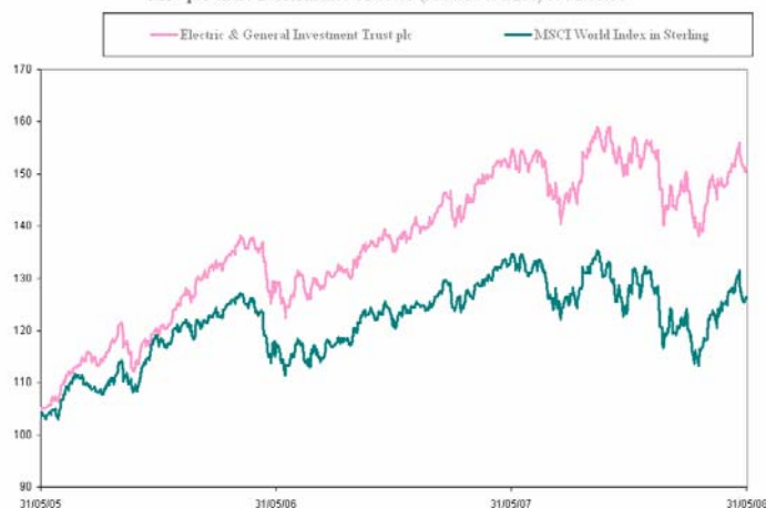
NAV per share Performance 01.05.05 (rebased to £100) to 31.05.08